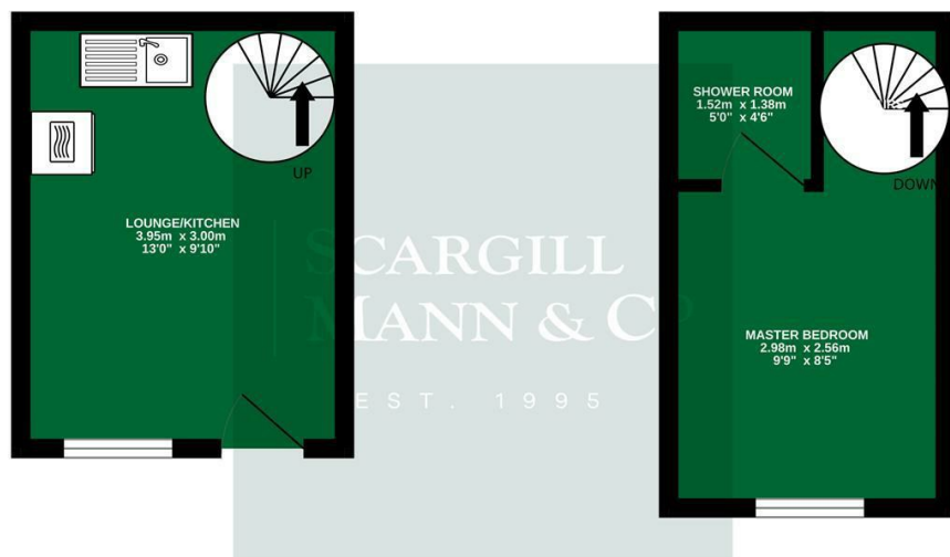
STONE BUILT COTTAGE

Whilst every attempt has been made to ensure the accuracy of the floorplan contained here, measurements of doors, windows, rooms and any other items are approximate and no responsibility is taken for any error, omission or mis-statement. This plan is for illustrative purposes only and should be used as such by any prospective purchaser. The services, systems and appliances shown have not been tested and no guarantee as to their operability or efficiency can be given. Made with Metropix C0024